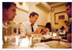
Al Sharpton sat here.