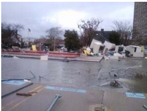
Seagate Beach Club on Coney Island (Karen Cofresi/Facebook)

NEW YORK (CBSNewYork) — A swanky Upper East Side hotel undergoing a complete renovation has used the opportunity to pitch in to the Superstorm Sandy relief effort.