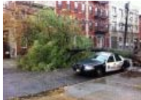
Your Sandy Videos

going to be a tremendous need to help people rebuild their homes and community centers,”