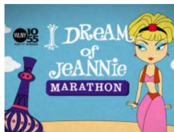
Monday On WLNY