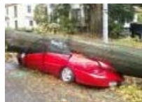
Swath Of Destruction