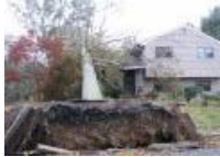
Disaster Relief Resources