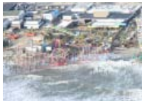
Seen From The Sky