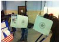
Sandy's Election Impact