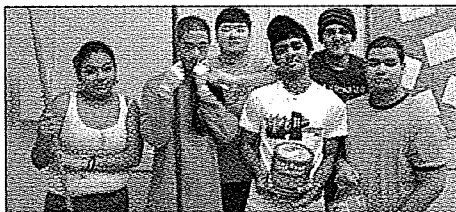
Horizons Academy students who gave the school's new technology center walls a fresh coat of paint